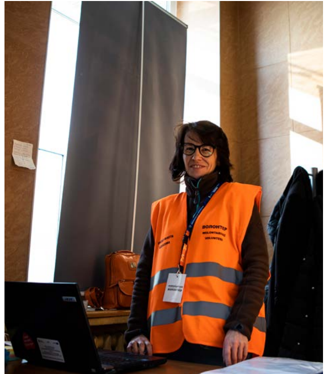
Response to the Ukraine refugee crisis – train station, Poland – March 2022.