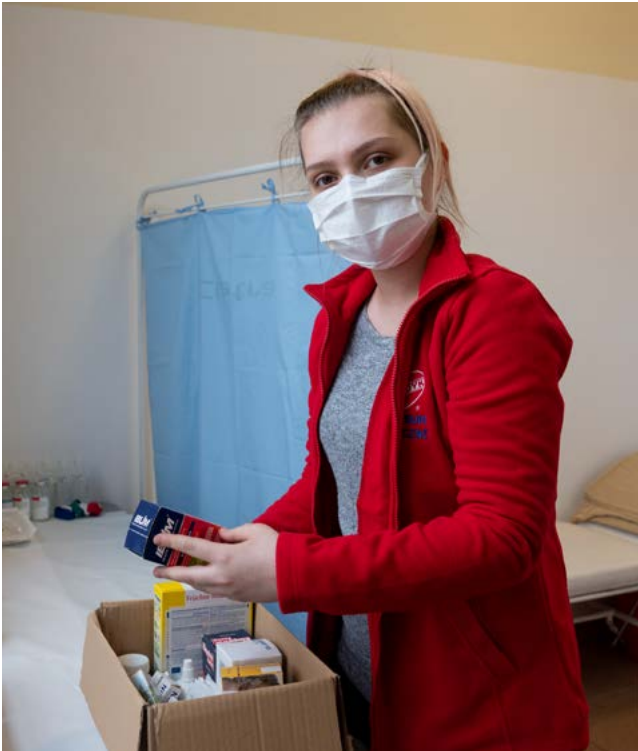
A nurse at the train station provides medical attention for Ukrainian refugees.