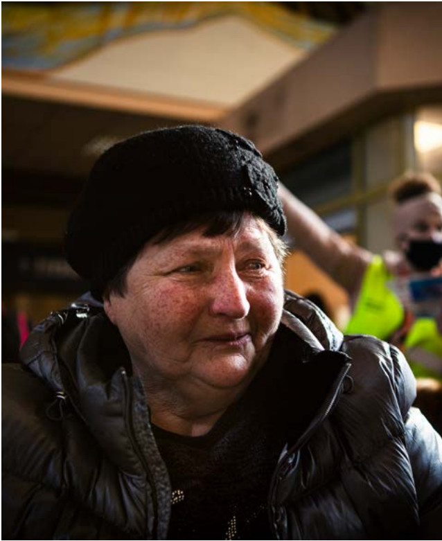
Response to the Ukraine refugee crisis – train station, Poland – March 2022.