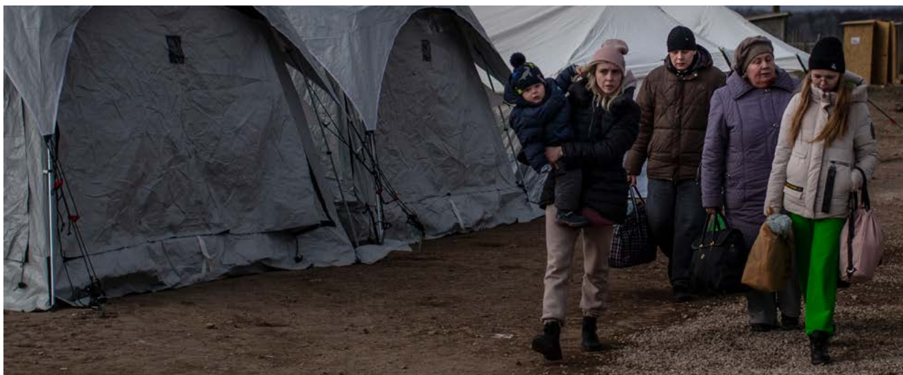
Ukrainian refugees at a refugee reception centre, near the Moldova-Ukraine border.