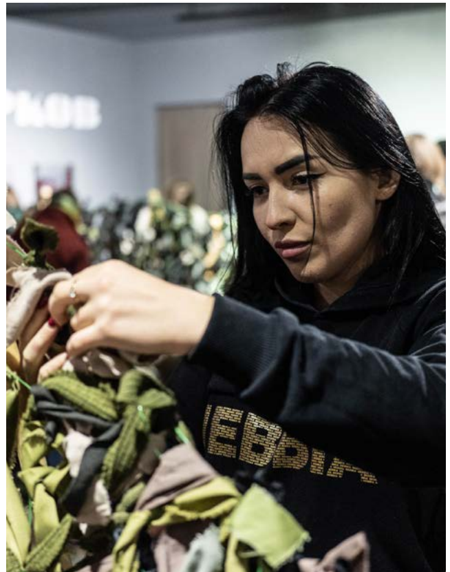
Volunteers support the armed forces of Ukraine and weave camouflage nets in Lviv, Western Ukraine.