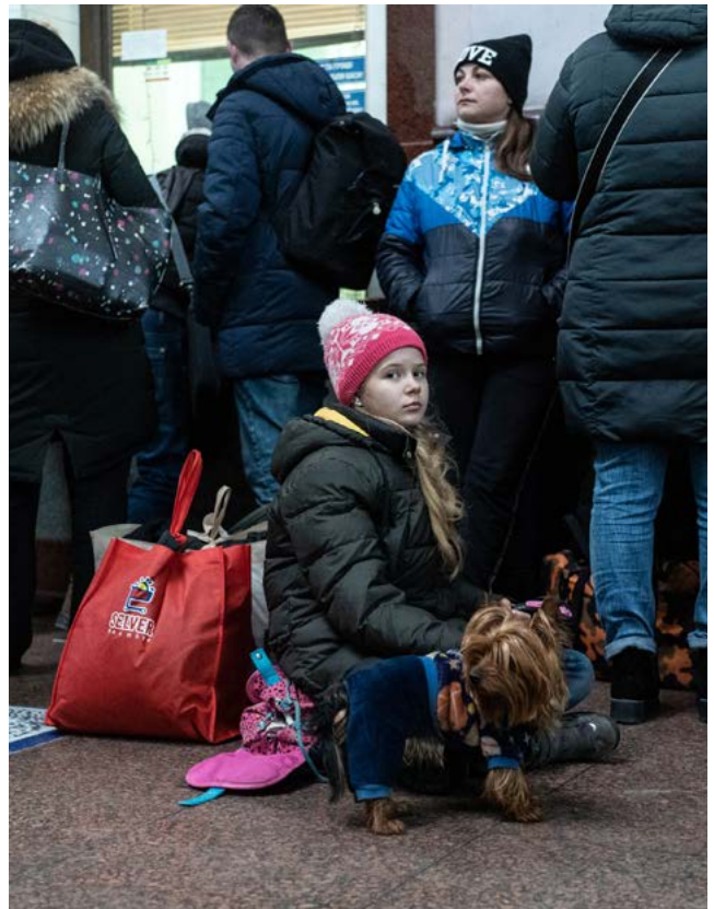
Citizens of Kyiv, capital of Ukraine, spend the night at the metro station Heroes of the Dnieper during the first days of the war, end of February 2022.