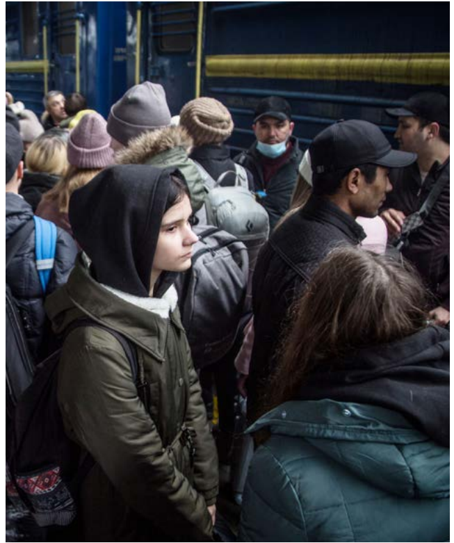
Kyiv railway station. 3 March 2022.