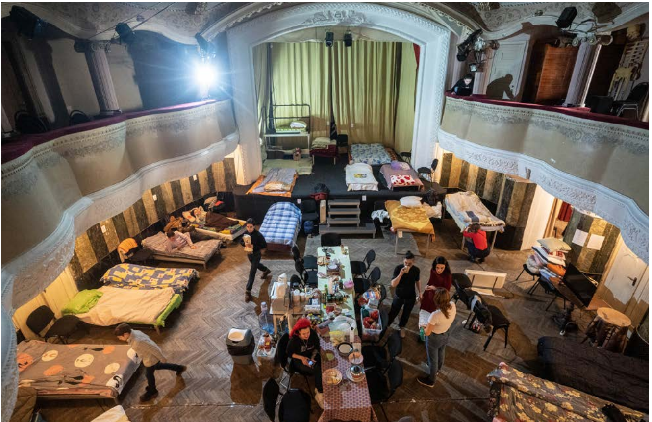
A theater in Lviv has become a temporary shelter for dozens of refugees fleeing Russian aggression in Ukraine.