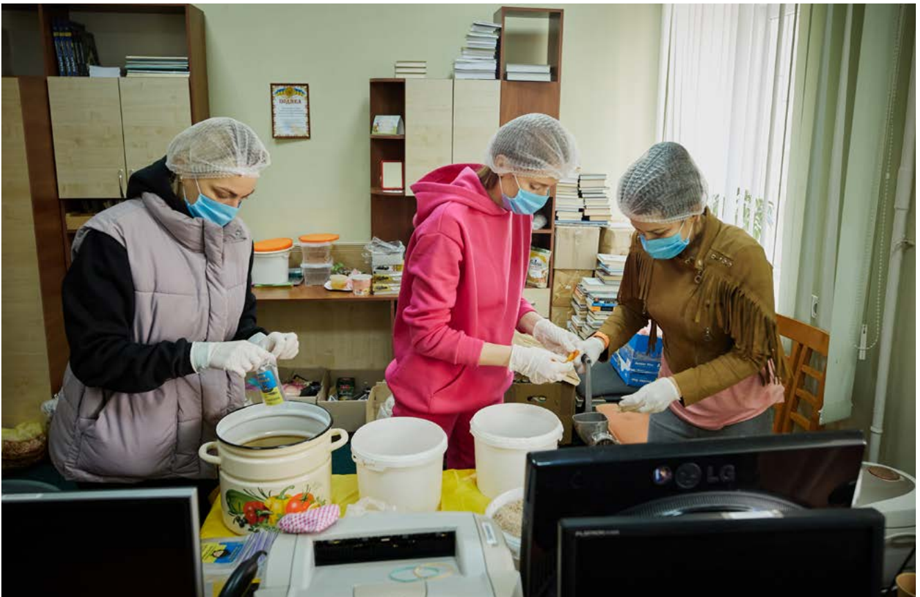
Employees of the Library for Youth set up a room for making healthy sweets for Ukrainian soldiers at the front. They pack nuts and honey in disposable bags and make energy bars from honey, nuts and dried fruits.