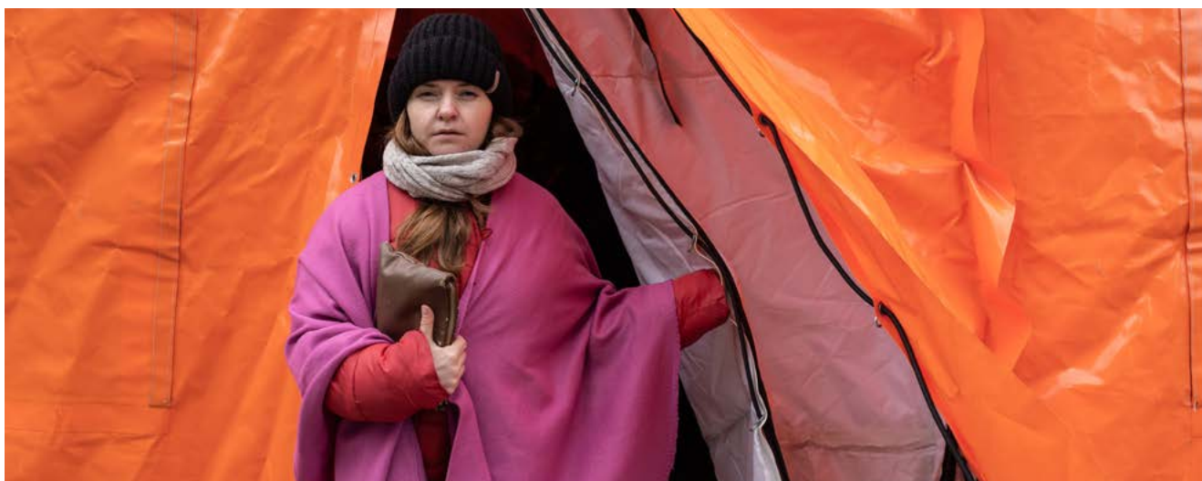
The railway station in Lviv has become a hub for those fleeing to EU countries from the war in Ukraine.

As part of the Ukraine response, CARE International is currently partnering with humanitarian organisations both inside Ukraine as well as neighbouring countries, including Romania, Slovakia and Poland. Aid distributions include relief items such as food, hygiene products and sleeping bags. CARE International also provides cash to affected populations, offers shelter and psychosocial support. We place a particular focus on working alongside women-led organizations and women in the humanitarian response.