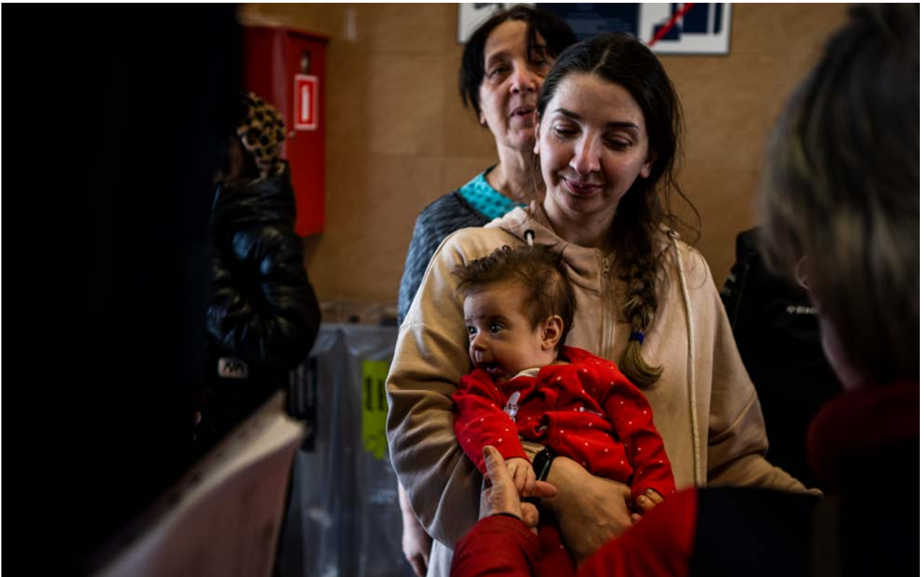
Response to the Ukraine refugee crisis – train station, Poland – March 2022 WHO.