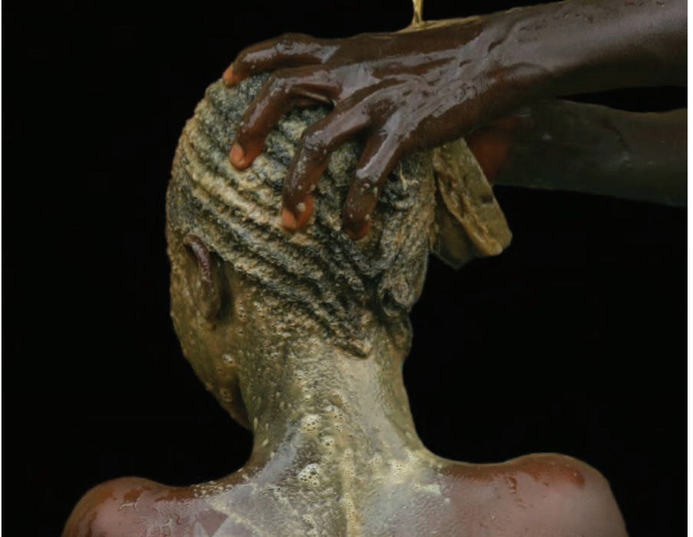
A female former child soldier takes part in a traditional cleansing ceremony before reintegrating back into her community in Sierra Leone.