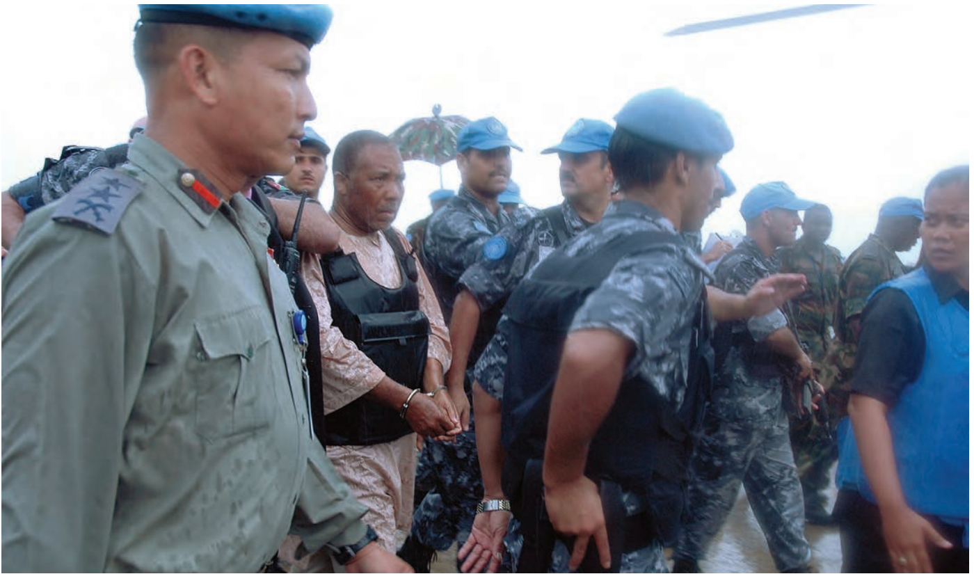
United Nations Mission in Liberia (UNMIL). Peacekeepers arrested former Liberian President Charles Taylor in 2006. Taylor was immediately transferred to the Special Court for Sierra Leone and was subsequently convicted of aiding and abetting the civil war in Sierra Leone. The charges included sexual and gender-based crimes.

Redress thus cannot be limited to specific violations alone, but must encompass measures to address the underlying inequalities that have shaped both the context of the violations and their impact. In other words, redress measures must incorporate ‘transformative justice’ as a goal. 7 Transformative justice seeks to address not just the consequences of violations committed