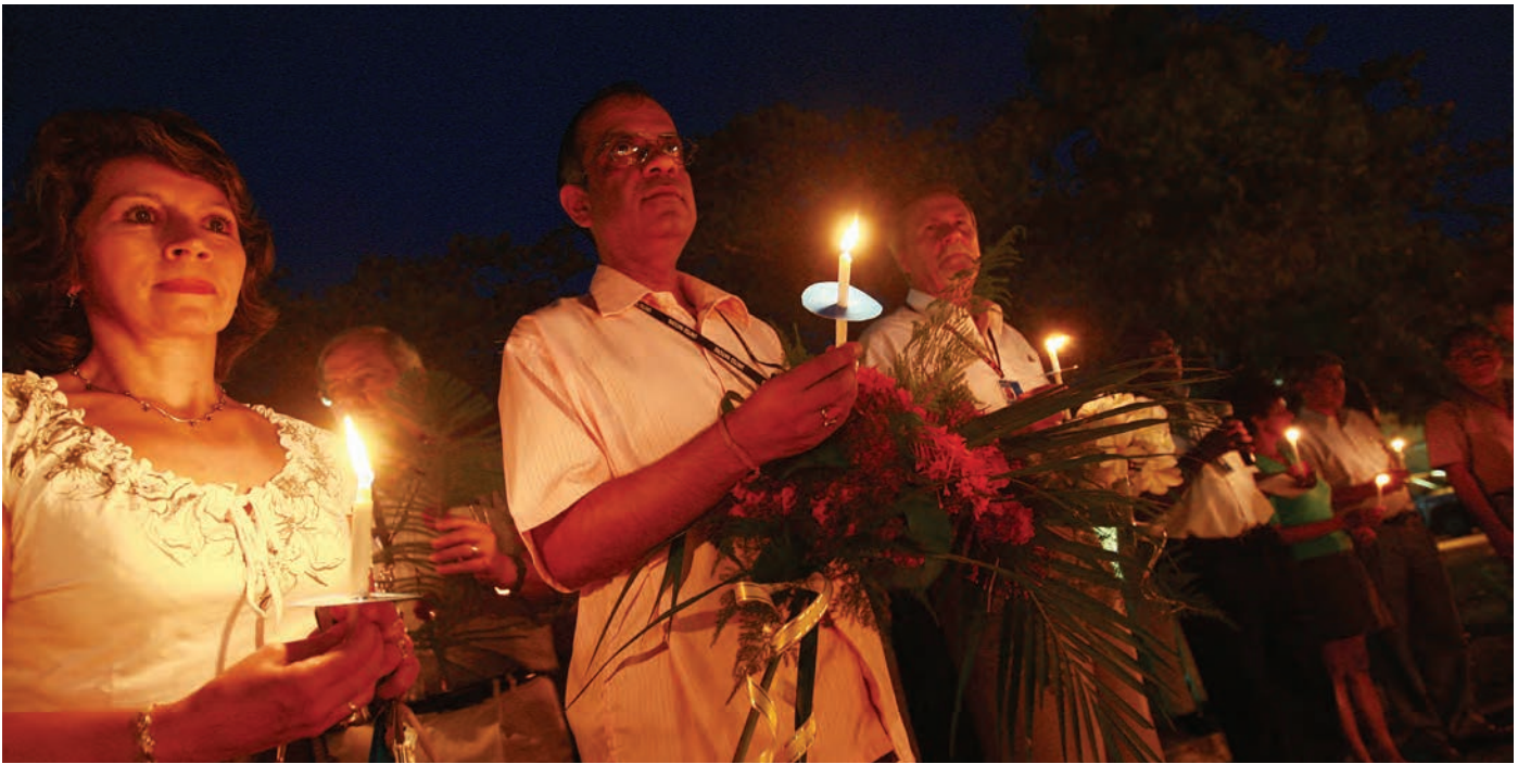
Atul Khare, then-Head of the United Nations Mission in Timor-Leste (UNMIT), accompanied by Finn-Reske Nielsen, former Deputy Special Representative of the Secretary-General for the United Nations Mission in Timor-Leste (UNMIT), attend a memorial ceremony to honour those whose lives were lost during the uprising which followed the announcement of the result of the Popular Consultation on 4 September 1999 in Dili.

social and criminal violence continue to have a disproportionate impact on women, hampering their participation in governance and reconstruction efforts. Gender-sensitive reforms must address barriers to access, whether they be law- or policy-related (e.g., the absence of laws to criminalize domestic violence or rape in marriage) or context-related (e.g., lack of police sensitivity and awareness of their duties regarding violence against women, absence of legal aid, or courts based only in urban areas). Reforms should also include adopting quotas for increasing the number of women in the justice and security sectors. In Liberia, for example, there have been numerous attempts to include women in security sector reforms, including through the establishment of quotas for recruiting women and specialized education initiatives for female recruits. In numerous countries, dedicated units for women and children have been established in police stations to strengthen access to justice. Evidence shows that apart from being simply a just democratic principle, increasing women's representation leads to higher levels of trust in institutions by women, reflected in higher levels of reporting of SGBV crimes. 68