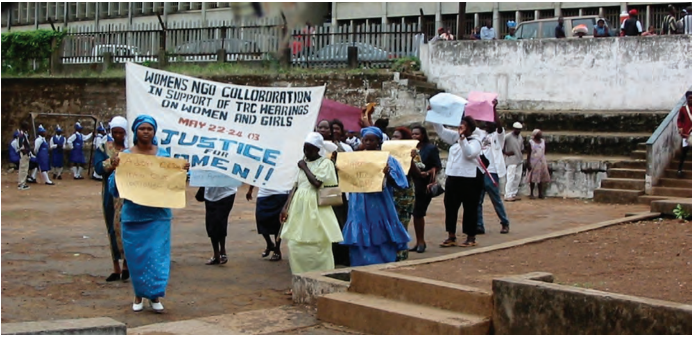
Demonstrators march in support of the TRC's hearings for women and girls in Liberia.