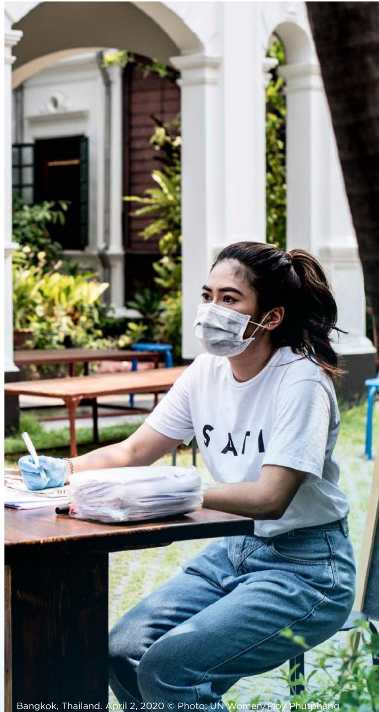
Bangkok, Thailand. April 2, 2020

Parliaments should take the opportunity presented by the pandemic to reflect on the gender sensitivity of their crisis response, and to make changes where appropriate.