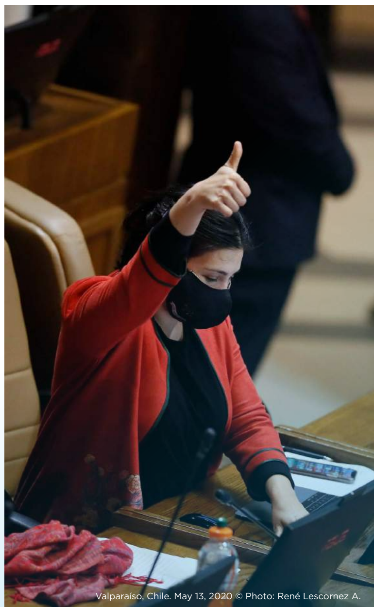
Valparaíso, Chile. May 13, 2020