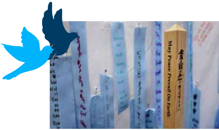
Peace Forum commemorates 15th Anniversary of UNSC Resolution 1325.

especially youngsters, by exploiting their emotional attachment to religion. VEOs used a more radical interpretation of Islam to justify their violent acts and to recruit new followers, who often had a rigid worldview, superficial knowledge of the Quran and a desire to 'belong' to something bigger.