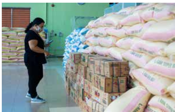
#MyCOVIDStory – Women frontliners.

Traditional gender norms have been reportedly reinforced during the pandemic while socioeconomic inequalities have been aggravated. Participants shared that while women have been on the front lines of COVID-19 responses, particularly within their communities, they have received limited recognition, visibility and resources to help their communities. At the same time, women have suffered increasing gender and sexual-based violence. In some cases, they have lost access to basic state services – such as free state medical services, including access to reproductive and sexual health advice and services – and access to justice, notably for cases of sexual and domestic violence. Women have also become vulnerable to cyberharassment, increasing mental health illness. Participants said such insecurity may lead to a loss of trust and faith in democratic institutions and it reinforces protectionist attitudes in communities.