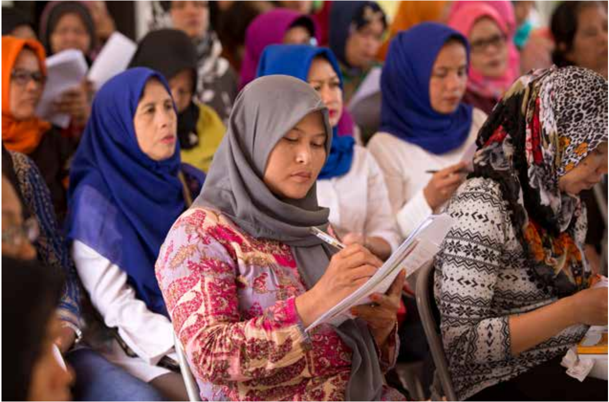
Indonesia - Safe Cities - Community Meeting.