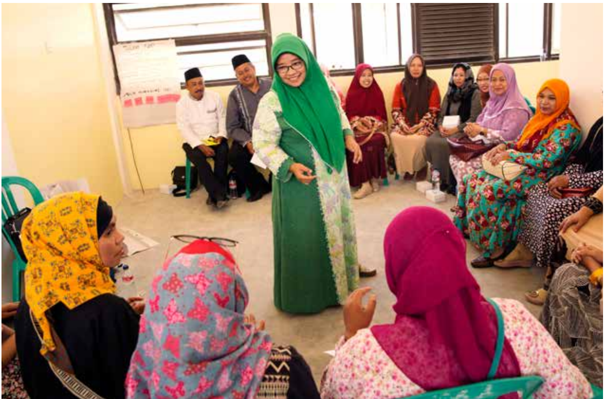
Indonesia - Community Peacebuilding Discussions.