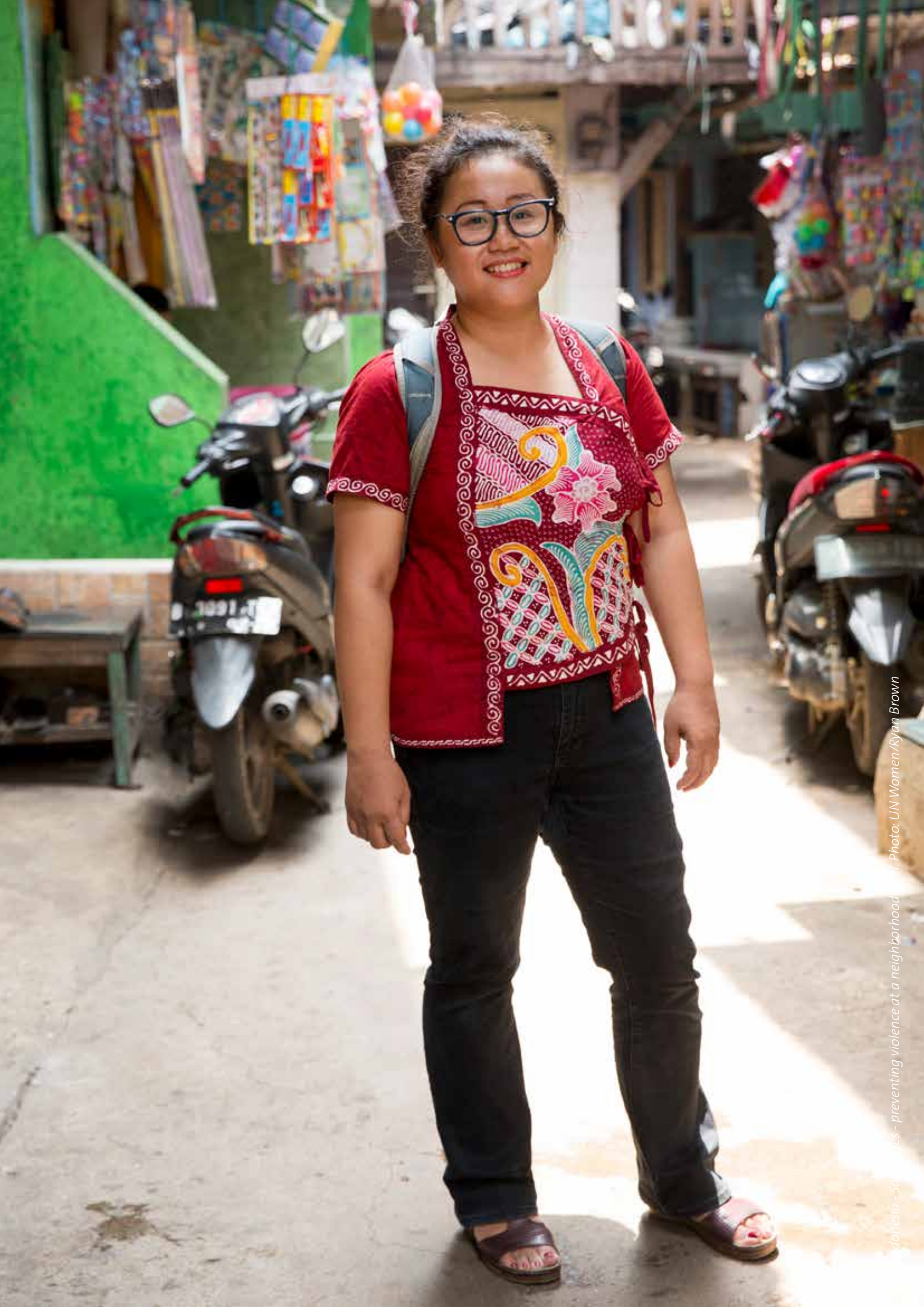
Indonesia - So... - preventing violence at a neighborhood level.