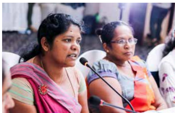
NAP Consultation - Sabaragamuwa Province - Sri Lanka 2019 - WPS.

CSO representatives called for the greater participation of civil society in peace and security issues, as well as PVE responses. They urged the United Nations to put in place concrete measures to ensure such participation, notably in relation to the implementation of