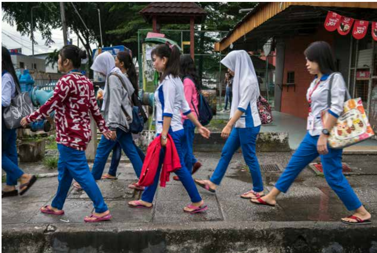
The roads travelled for work - Women Migrant Workers in Singapore and Malaysia.

in turn, limits women’s opportunities to address violent extremism. Participants said that the silencing of critical voices has been aggravated during the COVID-19 pandemic and several expressed concerns that this situation might be exploited by extremist groups. As such, ensuring respect for human rights