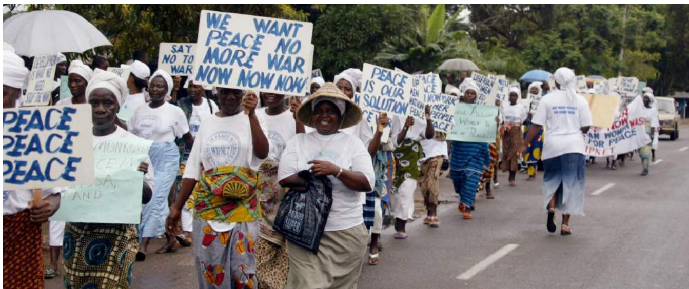
Women in the Peacebuilding Network WIPNET staging a protest march in front of the ECOMIL headquarters in Monrovia, Liberia.