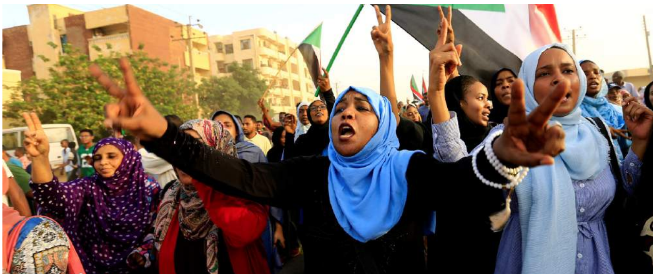
Sudanese protesters march during a demonstration to commemorate 40 days since the sit-in massacre in Khartoum, North, Sudan, on July 13, 2019.