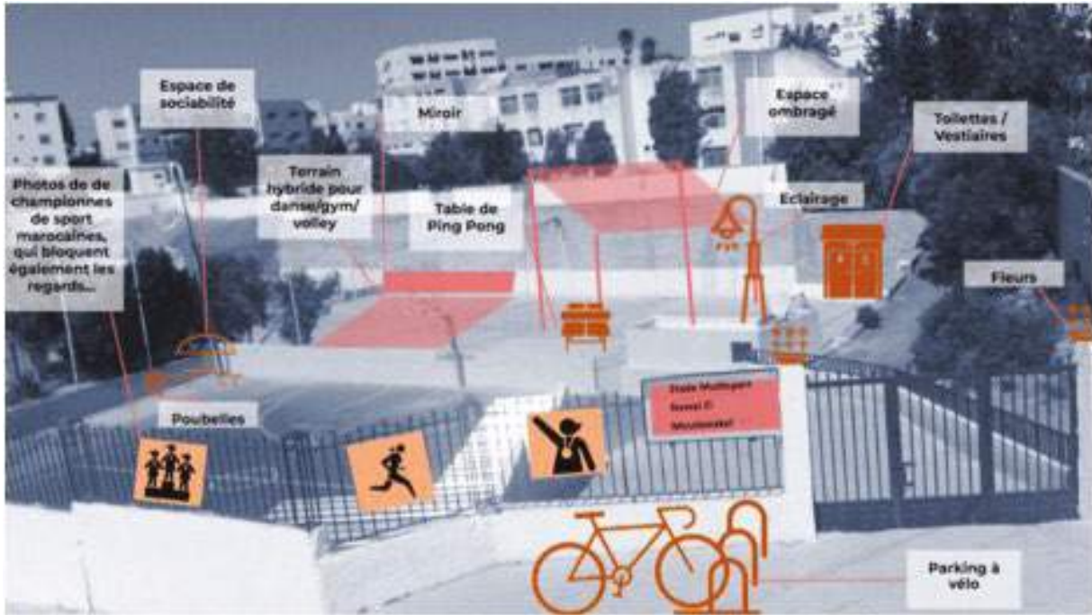
The gender-responsive guidelines developed by the Ministry of Housing and UN Women highlight design principles to support safe and inclusive public spaces that promote women and girl's safe mobility and access to services.

concerns expressed by women and girls by addressing simultaneous discriminations that women and girls face in Moroccan cities. During the validation process in different states, the study identified specific barriers to services and needs by women and girls with disabilities, women and girls who do not speak Arabic, women in care-related roles, and elderly women, including those with limited resources and/or education. 40