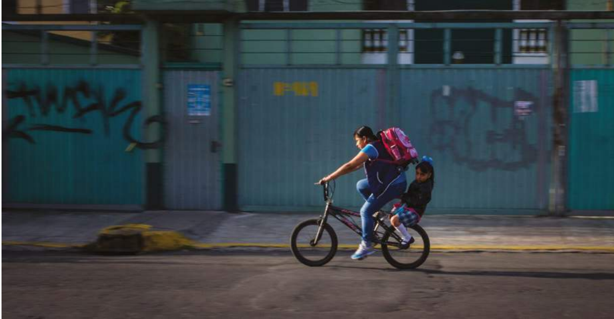
Guadalajara and Monterrey Safe City initiatives are strengthening the role of women’s organizations in monitoring women’s safety in public spaces.

In addition, two virtual sessions are provided one month after the training with each participant organization to address any questions and doubts regarding the process. By the end of the training, each organization will submit a final report including key findings and the next steps for their respective policy and legislative advocacy plans.