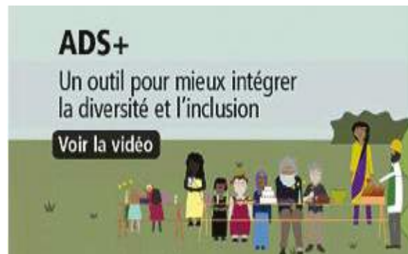
Image of the Video which present the Gender-differentiated analysis tool ADS+ for city employees

The deployment of ADS has revealed that the support and development of practical tools are essential conditions for success. The political will and openness of staff to innovate and adapt is also equally important to integrate this approach to all programmes and municipal services.